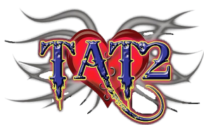
Oct 11 TAT2