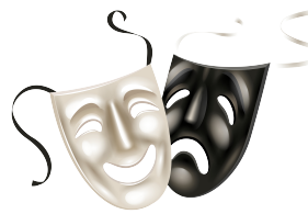
Oct 18: 5-9 PM Play & Dinner