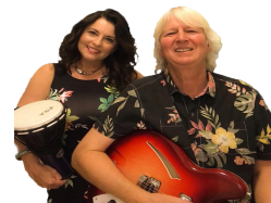
Oct 25 Jukebox Dreams