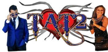
May 11 TAT2