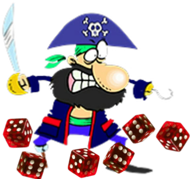
Ship Captain-Crew Saturday 1 - 3 PM