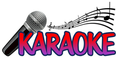
Friday 6:30 - 9:30 PM