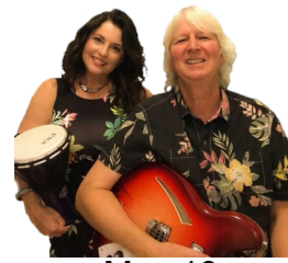
May 18 Jukebox Dreams