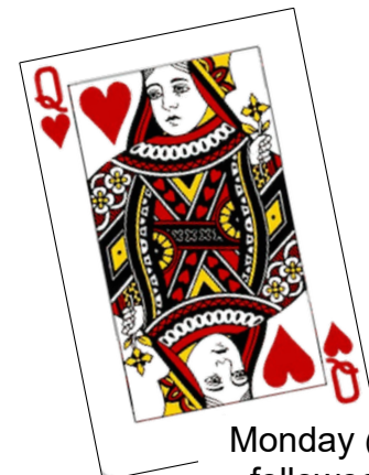
Monday @ 6 PM followed by ...