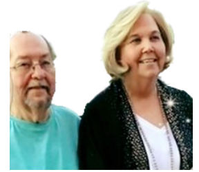
May 25 Unchained