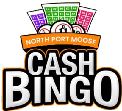
Thursday @ 6:30 PM First Saturday @ 11 AM