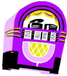
May 4 Free Jukebox