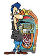
June 28 Free Jukebox