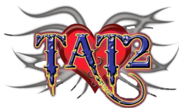
June 14 TAT2