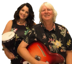
June 7 Jukebox Dreams