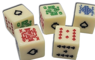
POKER DICE TUESDAY 1 - 3 PM