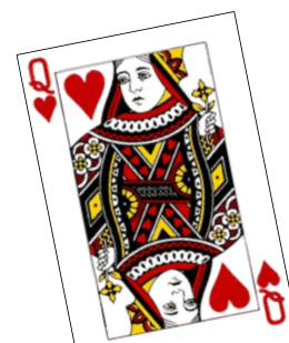
Monday @ 6 PM followed by ...