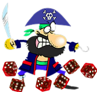
SHIP-CAPTAIN-CREW SATURDAY 1 - 3