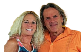
July 26 PopRox