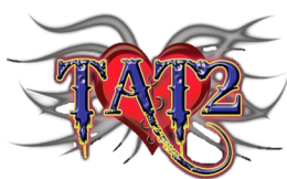
July 12 TAT2