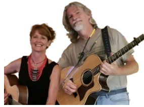
Feb 8 Red Angel