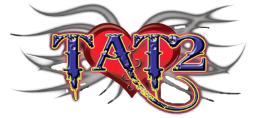
Feb 22 TAT2