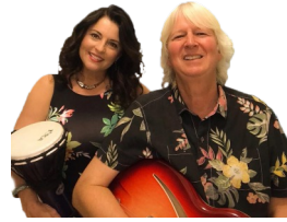
Feb 15 Jukebox Dreams