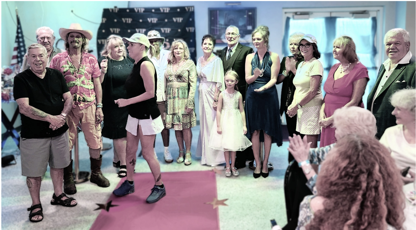
On the Runway at the WOTM Chapter's August Fashion Show