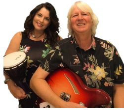
March 9 Jukebox Dreams