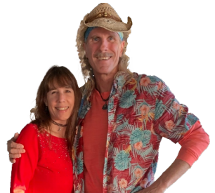
March 30 Rocky Trop