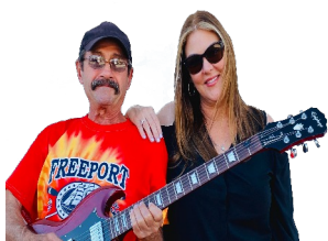
June 1 Black Velvet