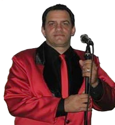
June 15 Classics in Concert