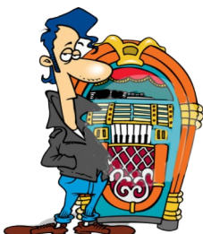
June 8 FreeJukebox