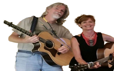
June 29 Red Angel Duo