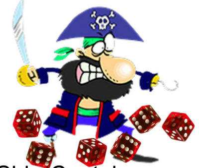
Ship-Captain-Crew Saturday 1 - 3 PM