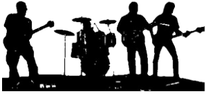
SATURDAY, JAN 6 AMERICAN MUSIC CO.