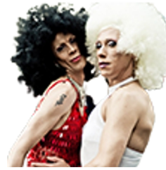
SATURDAY, JAN 20 TWISTED BEAUTY CONTEST