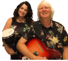
SATURDAY, JAN 13 JUKEBOX DREAMS