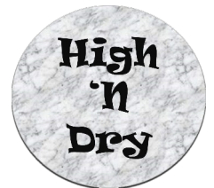
Aug 31 High-n-Dry