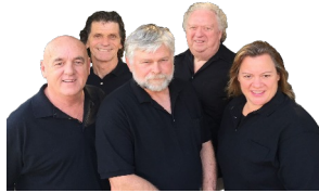
Aug 10 Country Express