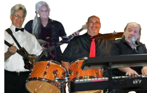
Aug 24 Still Rockin'