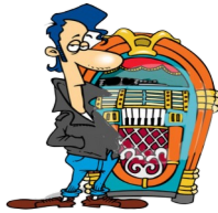
Aug 17 Free Jukebox