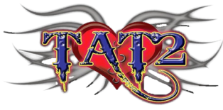
Aug 3 TAT2