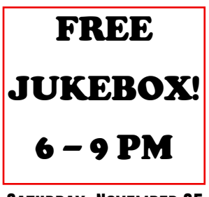
SATURDAY, NOVEMBER 25