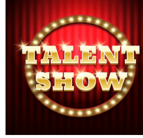
SATURDAY, NOVEMBER 18 TALENT SHOW