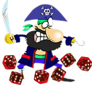
SHIP-CAPTAIN-CREW SATURDAY 1 - 3 PM