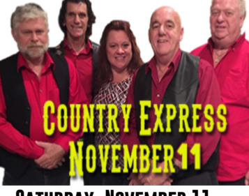
SATURDAY, NOVEMBER 11 Country Express