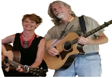
SATURDAY, OCTOBER 14 RED ANGEL DUO