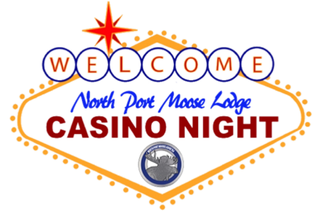
SATURDAY, OCTOBER 28 4 PM