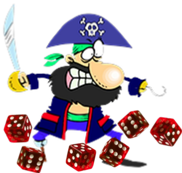
SHIP-CAPTAIN-CREW SATURDAY 1 - 3 PM