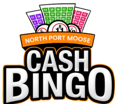
Thursday @ 6:30 PM First Saturday @ 11 AM