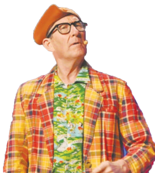
Harley Worhtit Live!!- Sept 23