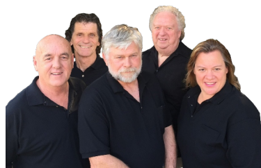
SATURDAY, SEPTEMBER 9 COUNTRY EXPRESS