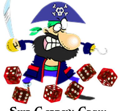
SHIP-CAPTAIN-CREW Saturday 1 - 3 PM