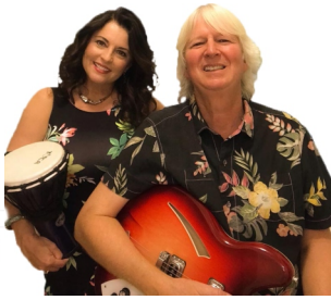
SATURDAY, JULY 8 JUKEBOX DREAMS