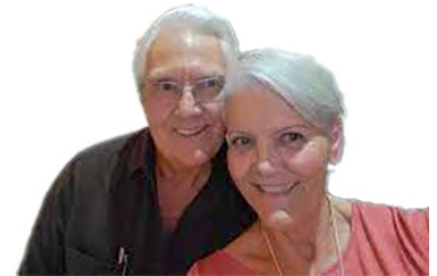
SATURDAY, JULY 29 REMEMBER WHEN