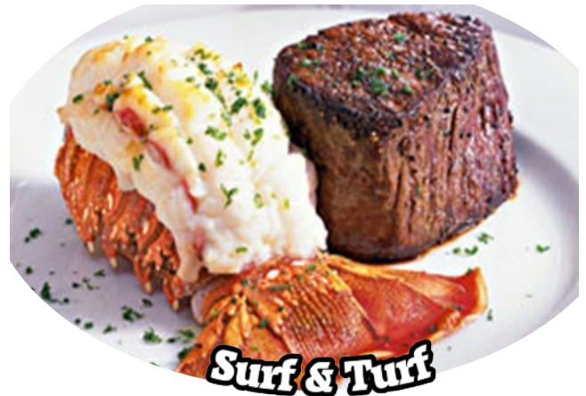
Surf & Turf

All activities described in this newsletter, including meals, are only available to members of the Loyal Order of Moose and their qualified guests. Guests may not make any purchases and must leave when their host leaves.