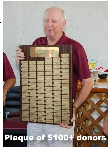
Plaque of $100+ donors

The governor then presented a plaque recognizing the King-Logie Foundation's donation and another with the names of those who donated $100 or more. Be sure you check out the Tiki bar next time you're at the lodge.