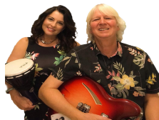
Sep 6 Jukebox Dreams