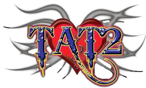
Sep 13 TAT2