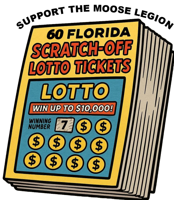
Book of 60 Florida Scratch-Off Tickets $5 ticket: drawing when all tickets sold

Remember to always be kind. Fraternally yours, Gail Soderman, WOTM Sr. Regent