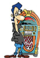
Sep 27 Free Jukebox